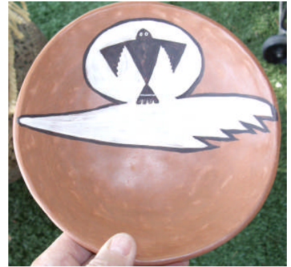
(Left) Mimbres feathered-flying celestial entity by a mammal-fish constellation in the Milky Way (hence the checkerboarding motif); (Center and right) Mimbres comet image (rotated) by a bird constellation and this singular motif repainted by author.