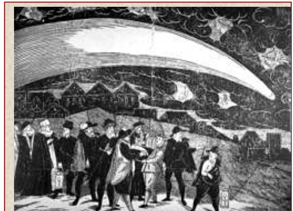
The Jiri Daschitzky image of the great comet of 1577 (Don Yeomans collection) depicts the artist drawing the comet by an assistant's held candlelight as the great comet stretched along the ecliptic from Sagittarius thru Capricorn, Aquarius, Pisces, and past Aries. (*See cover Schechner 1997)